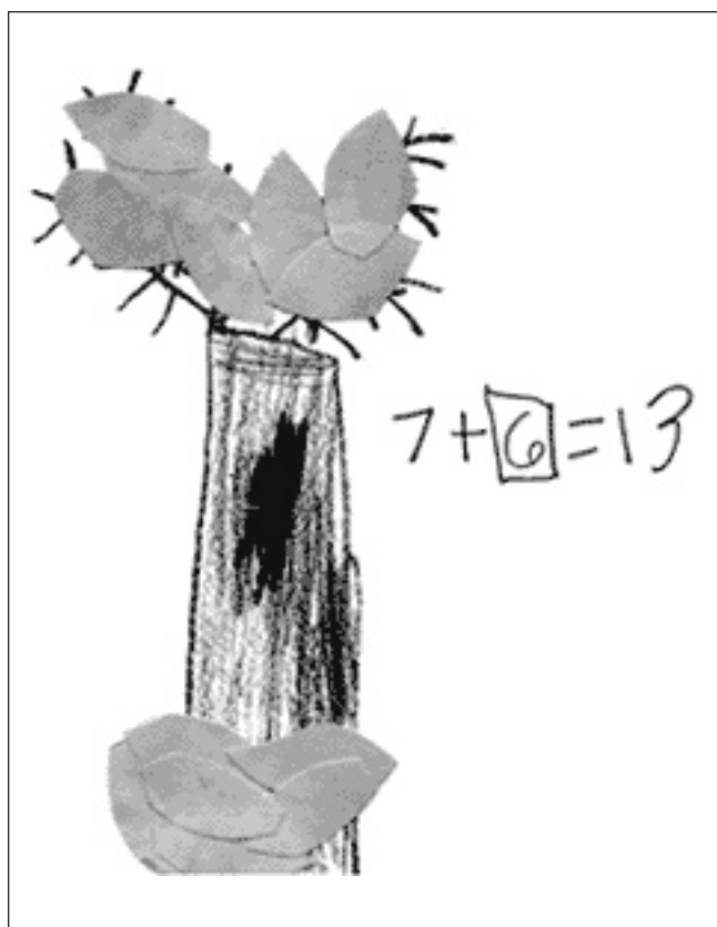
Figure 2. Aaron saw the leaf-blowing situation as an addition problem.