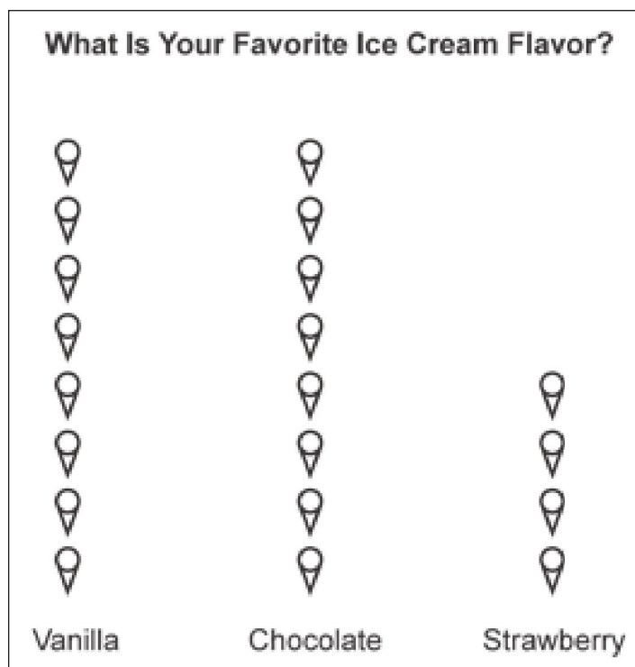
Figure 2. Students used pictures of ice-cream cones to show their favorite flavors.

Consider bar graphs as well. (See Figure 3.)