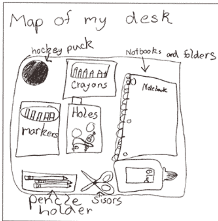
Figure 3. Shelby mapped the inside of her desk.