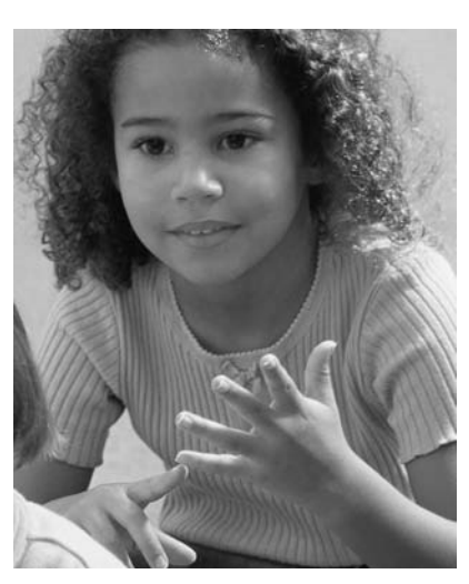
The key is providing children opportunities to build their own understanding.

dren to make sense of ideas for themselves in order to gain understanding. That's because in these situations, the source of the child's understanding is internal. It resides within the child. We can present children with learning opportunities, but then we must rely on the child to construct meaning from the activity, problem, or investigation that we present. This is neces-