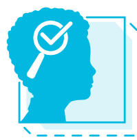
FOCUS & COHERENCE