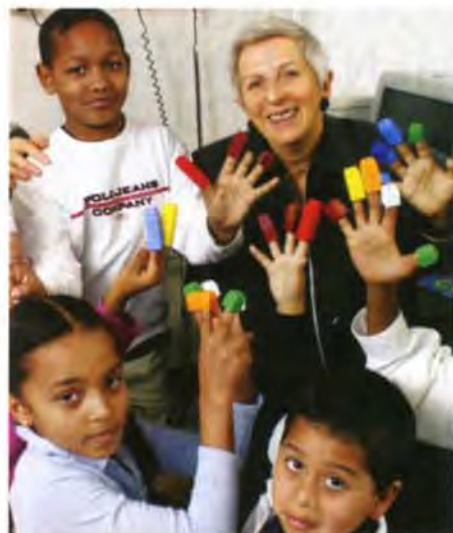
LEFT: I begin the read aloud by asking the children to judge the book by its cover.

Lastly, I gave the children an independent assignment. Each child chose one of the number sentences from the chart, copied it, and illustrated it. “You can draw ducklings or any other shapes,” I told them. The result: artful number sentences from ducks to diamonds! Children ready to take on an additional challenge also wrote and illustrated their own equations, with combinations of more than two numbers that added up to seven.