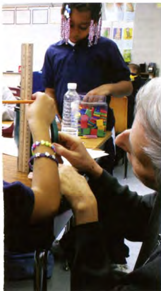
LEFT: Leo Lionni's Inch by Inch is an ideal choice for combining literacy and hands-on learning.