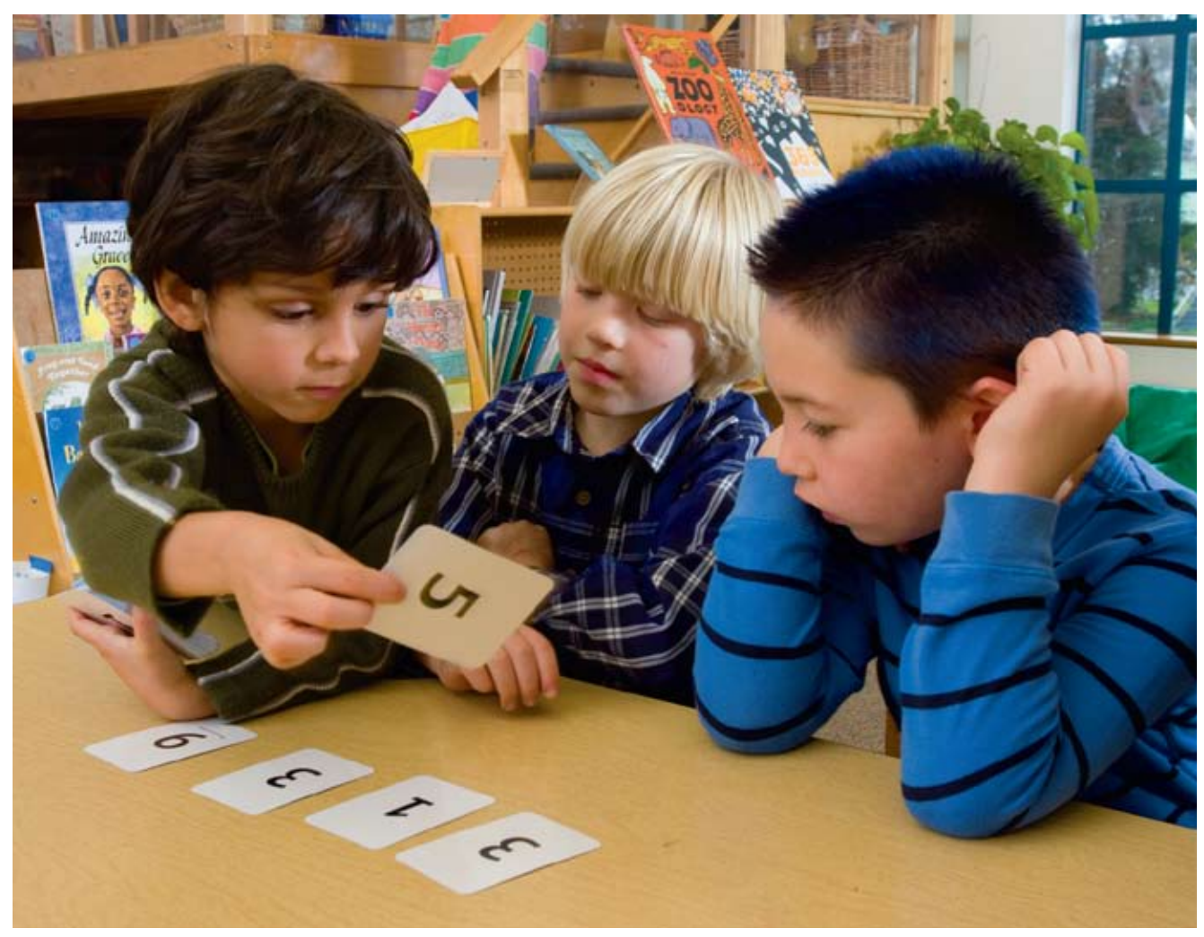
Playing Seven Up: Having students play together in small groups encourages communication while they learn about the numbers that add to 10.

addition.) Then find the sum that came closest to 100 without going over. Post the winning game board and have the others check the addition. With a whole class, it's likely that more than one student will get the same winning sum.